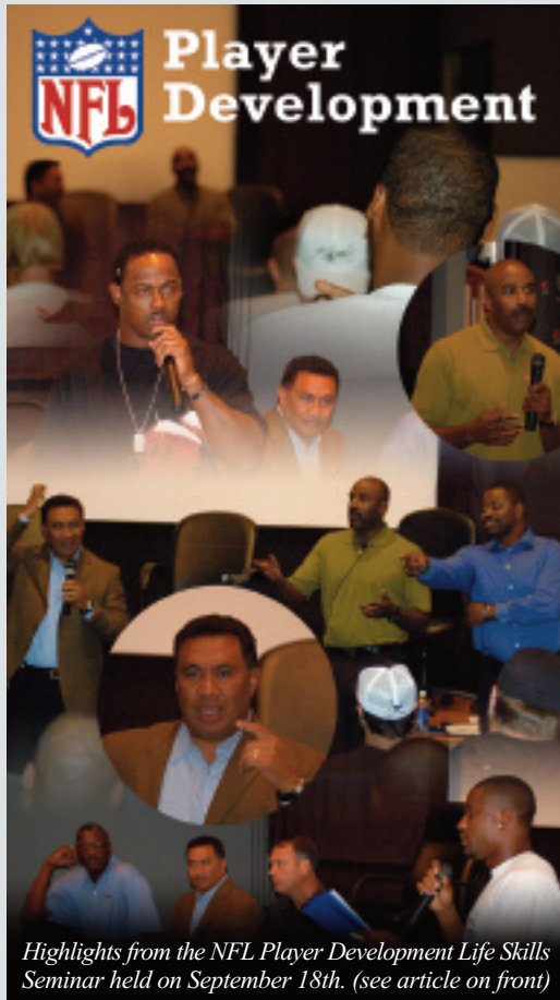
Highlights from the NFL Player Development Life Skills Seminar held on September 18th. (see article on front)