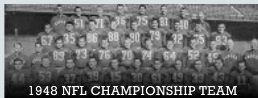
1948 NFL CHAMPIONSHIP TEAM