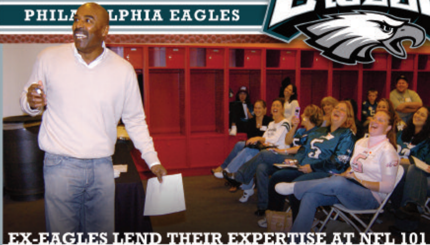
EX-EAGLES LEND THEIR EXPERTISE AT NFL 101